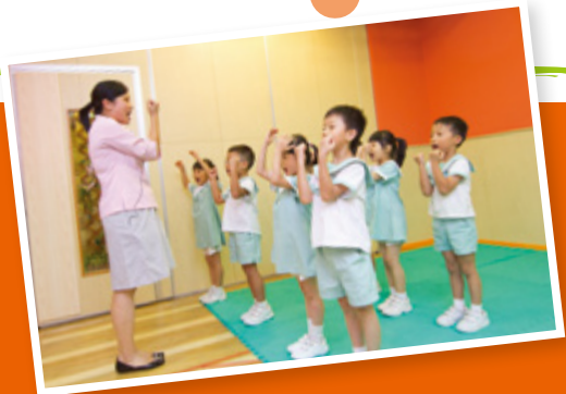
▲ After receiving one year of services from Heep Hong, about 30% of children at risk of dyslexia caught up with their peers on language ability.

▼ Children improve their ability to form word phrases through interesting activities.