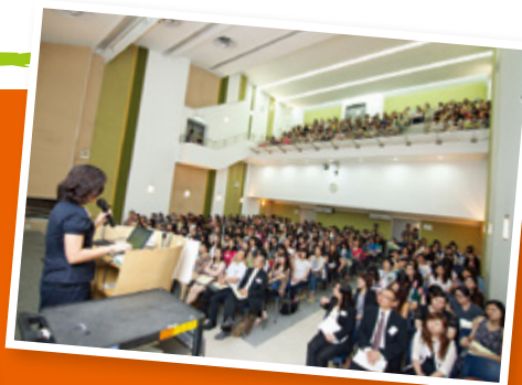
▲ Heep Hong launched the first support programme for children at risk of dyslexia at kindergartens.

systematic manner. Based on clinical experience, if children do not receive timely and appropriate support, their learning difficulties will persist and directly affect their motivation for and performance in language learning. In the long run, their performance in other subjects and personal development may suffer.'