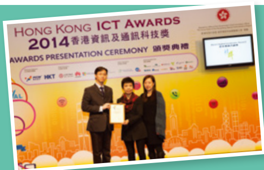
◀ The Pre-writing Fun Journey app wins the Best Digital Inclusion (Product/Application) Certificate of Merit.