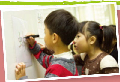
▲ Occupational therapists design professional training activities to improve children's handwriting.

▼ The Support Programme for Children with Specific Learning Difficulties is extended to 2016.