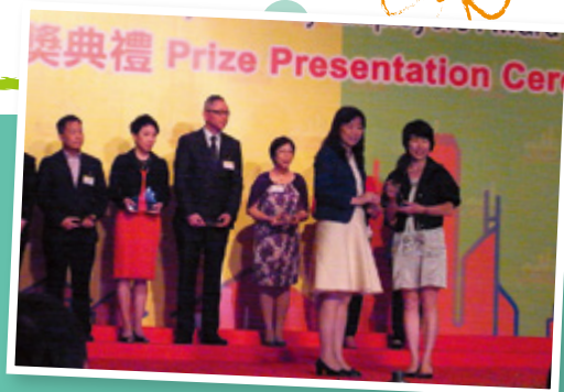
▲ Heep Hong is honoured with the 2013/14 Distinguished Family-Friendly Employer Award.