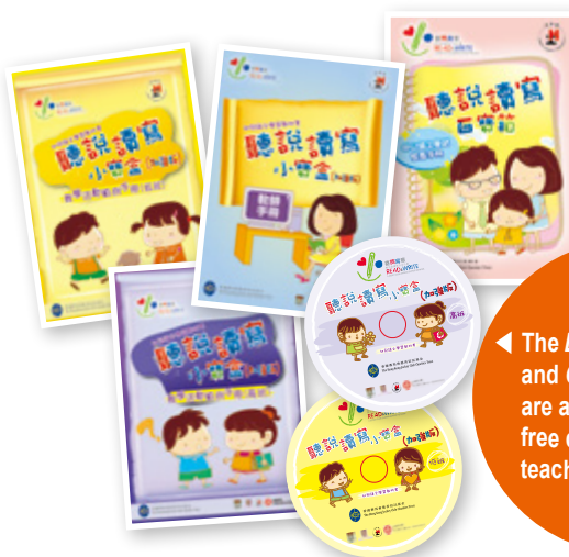
◀ The Enhanced Edition and Guide for Parents are available for free distribution to teachers and parents.

Published in May 2014, The Language Learning Package for Pre-primary Children (Enhanced Edition) is enriched with clinical experience of educational psychologists, speech therapists, occupational therapists and preschool teachers, as well as sample teaching activities for illustration. It is distributed free of charge to teachers at kindergartens and nurseries. The Guide to Language Development of Pre-primary Children for Parents , compiled by the same professional team, is also distributed to parents for training their children at risk of dyslexia. For details, please visit our website ( www.heephong.org ) or call 2391 2939.